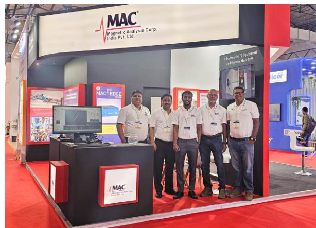
MAIPL Team showcasing at TUBE INDIA 2024 (Nov. 27-29) in Mumbai.

For more information, please contact info@mac-ndt.com .