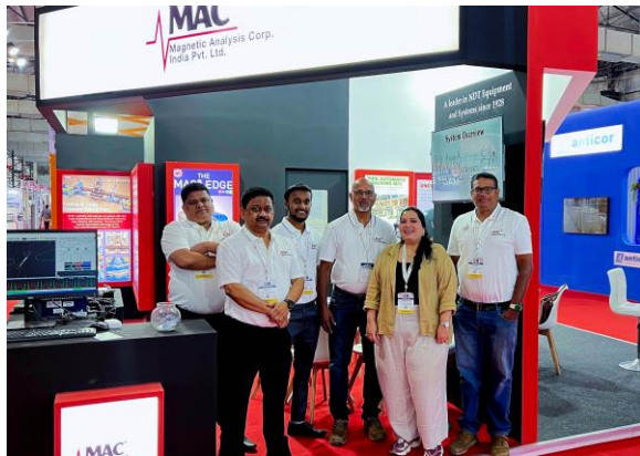
MAIPL Team and Inmar at TUBE INDIA 2024 booth.

The establishment of MAIPL marks a significant milestone in MAC's mission to collaborate with Indian producers and fabricators of tube, bar, wire and parts serving industries such as Oil Country Tubular Goods (OCTG), aerospace, medical, automotive and infrastructure. MAIPL's seamless support at every step—from consultation to installation ensures these sectors have access to the latest in NDT innovation.